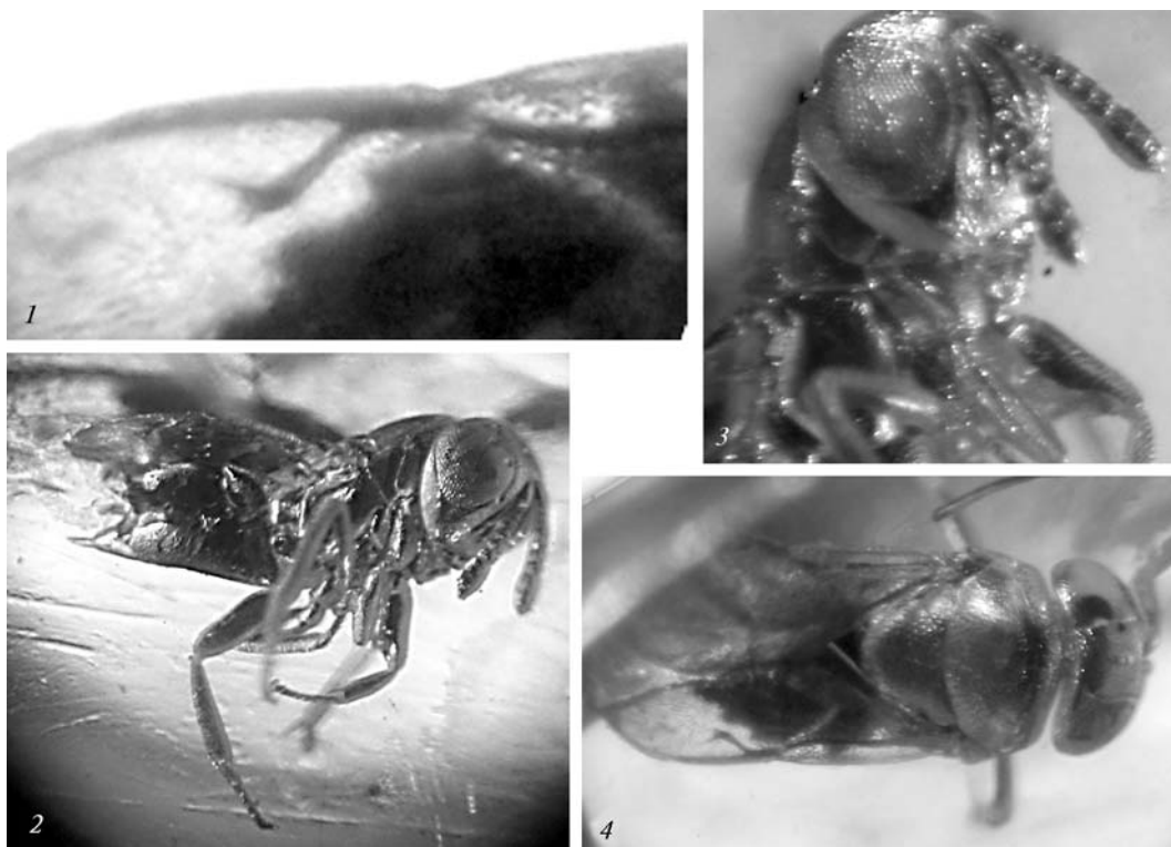
Рис. 2. Eocencnemus sugonjaevi , ♀, голотип, UA-363, ровенский янтарь, поздний эоцен: 1 – жилкование передних крыльев; 2 – вид сбоку; 3 – голова и усики; 4 – вид сверху.

Fig. 2. Eocencnemus sugonjaevi , ♀, holotype, UA-363, Rovno amber, Late Eocene: 1 – venation of fore wing; 2 – lateral view; 3 – head and antennae; 4 – dorsal view.