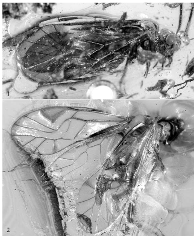
Fig. 1–2. Rovno amber barklice (Psocoptera): 1 — Valenzuela prometheus (KF-9, Klesov, Rovno amber, Eocene); 2 — Psocidus multiplex (UA-1319, Rovno amber, Eocene).

Comments. Valenzuela is distributed throughout the world and, with 300 named species, is presently the most species-rich genus in the order Psocoptera.